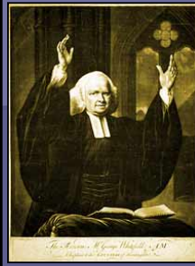
George Whitefield 1714-1770

When our Lord was pleased to take upon himself the form of a servant, and to go about preaching the kingdom of God; he took all opportunities in public, and more especially in private, to caution his disciples against seeking great things for themselves, and also to forewarn them of the many distresses, afflictions and persecutions, which they must expect to endure for his name's sake.