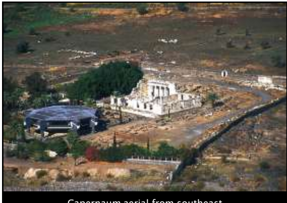
Capernaum aerial from southeast