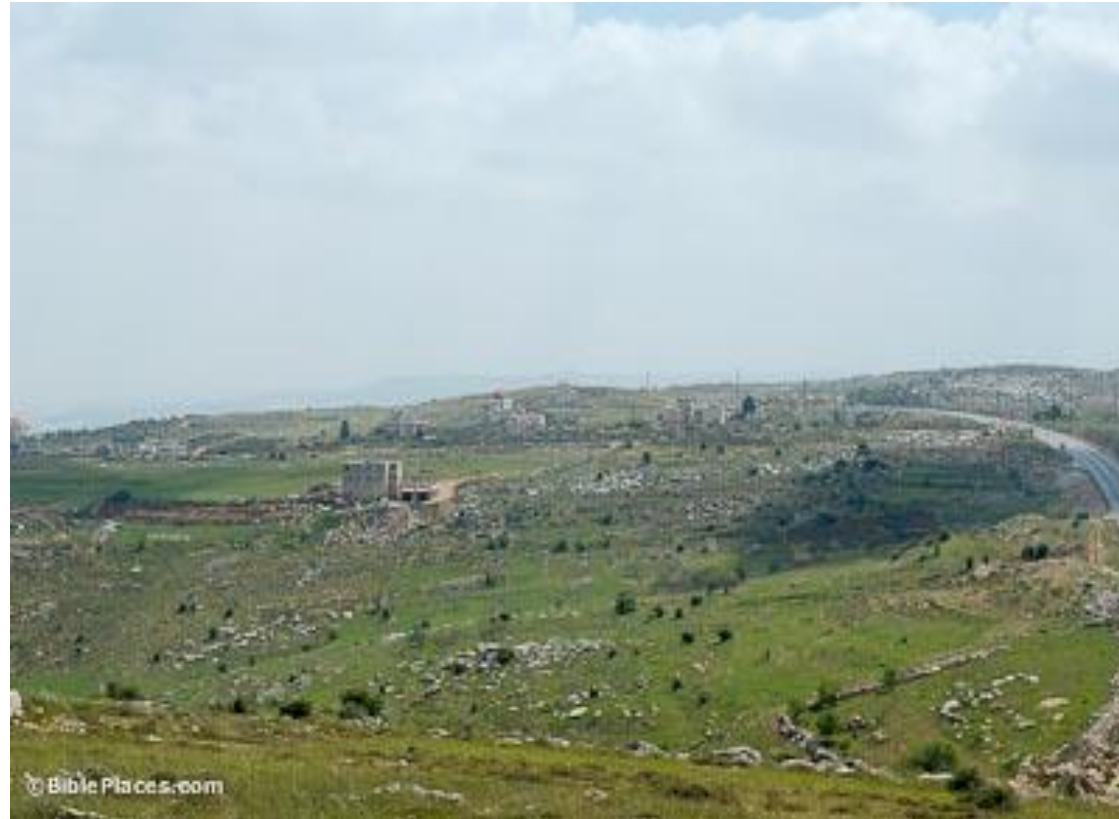
Possible Site of Ai