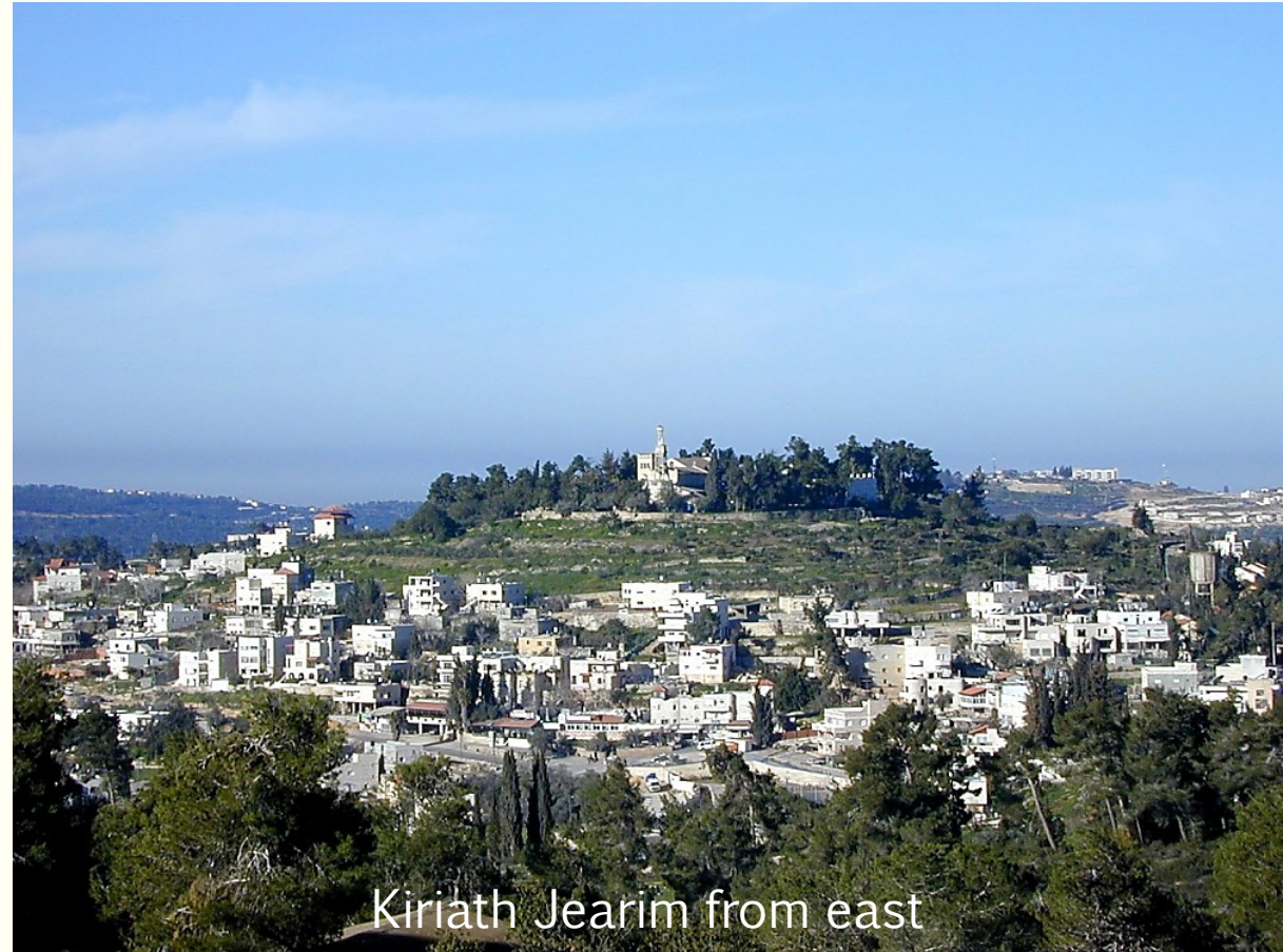
Kiriath Jearim from east