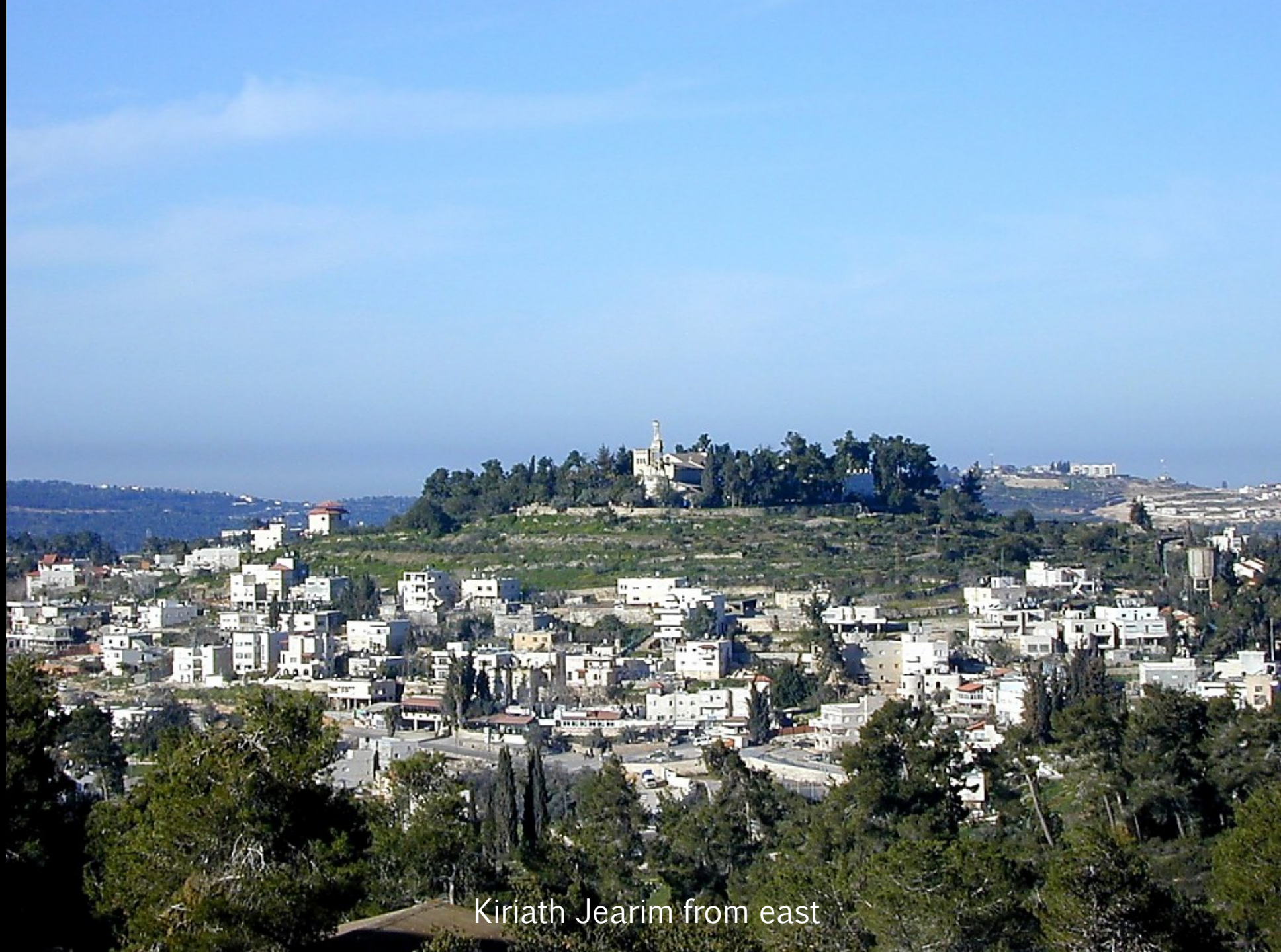
Kiriath Jearim from east