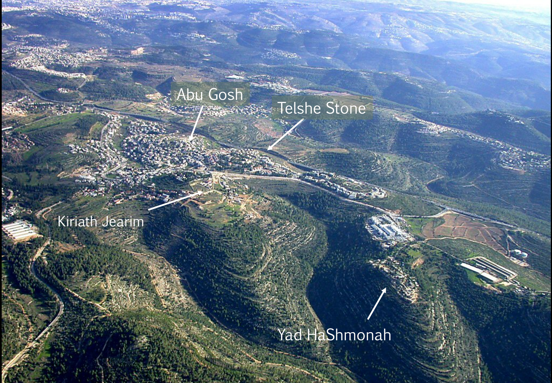
Kiriath Jearim from north aerial