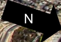
Jerusalem aerial from east